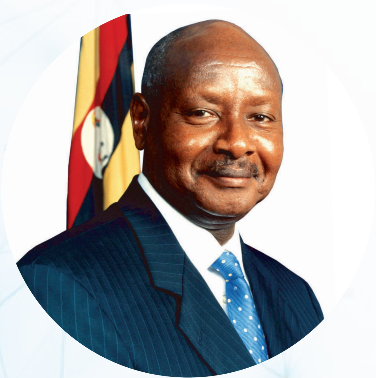
HIS EXCELLENCY, GENERAL, YOWERI KAGUTA MUSEVENI THE PRESIDENT OF THE REPUBLIC OF UGANDA