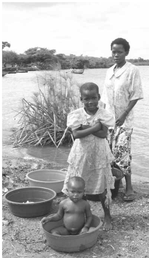
FIG. 1. Mother-and-child bathing practices along the Ugandan shoreline of Lake Victoria can place infants at increased risk of passive exposure to schistosome-infested water. This girl (aged 18 months), who, for fear of drowning, has perhaps never yet fully entered the lake on her own, is passively exposed to schistosome cercariae by being regularly bathed, either by her mother or an older sister, in a basin filled with freshly-drawn lakewater.

Both in terms of transmission reduction and the dynamics of morbidity, interest is again increasing in schistosome infections acquired at such a very early age (Mafiana et al. , 2003). Bosompem et al. (2004), for example, found that the child-bathing practices in certain locations in Ghana passively placed infants at significant risk of infection and therefore even pre-school children should be considered for regular chemotherapy. Along the Ugandan shoreline of Lake Victoria, shaft wells and pit latrines often collapse because of their poor construction and the very soft lakeside soils, and these failures not only leave the lake as the main source of water for the lakeshore communities but also increase the faecal contamination of the lakewater. The image shown in Figure 1 is typical of the local bathing practices of mothers and their infants from these impoverished lakeshore villages. Unfortunately, despite the probably high