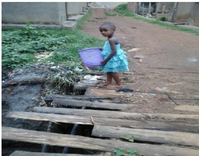
Figure-6: Dumping rubbish in channel flowing into river Rwizi.

The activities of agriculture; tree cutting, brick lying, construction of buildings at river bank, waste dumping along the river; and channeling of sewerage to the major factors leading to degradation of the river. Conservation measures established during the study are indicated in Figure-10.