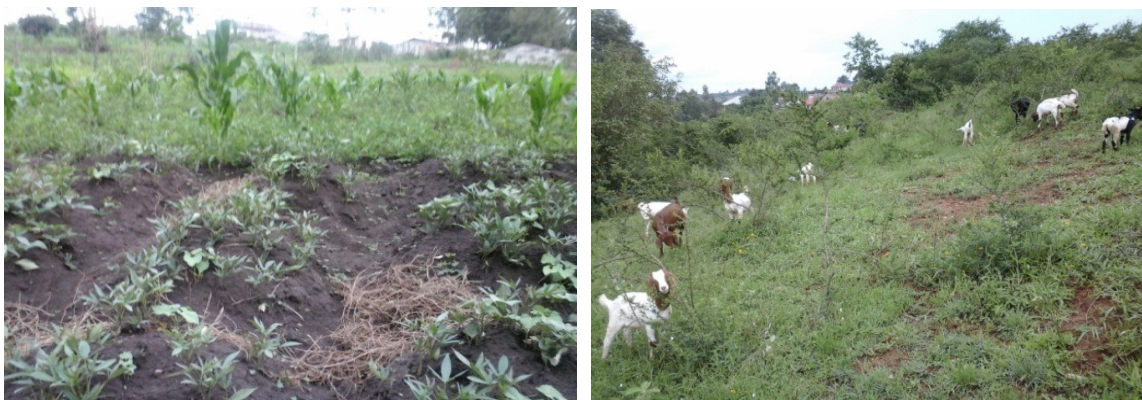
Figure-2: Crop growing and animal rearing along river Rwizi.