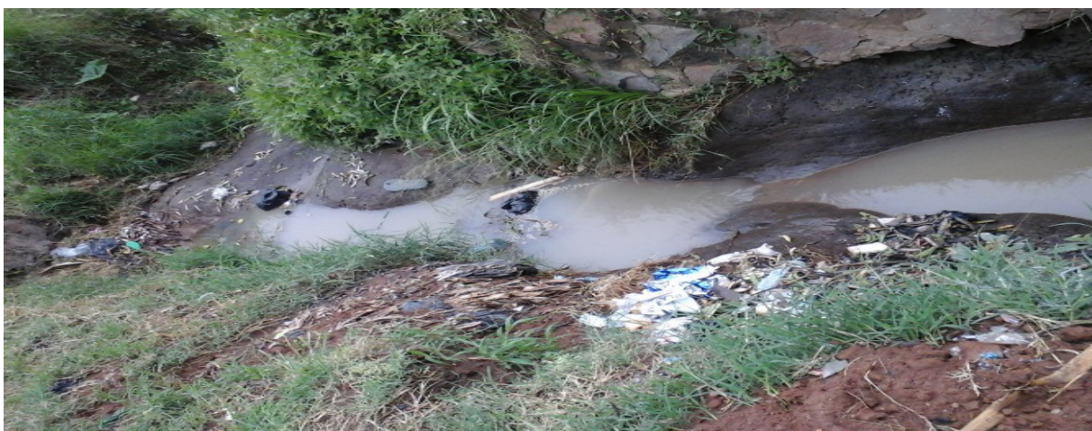
Figure-9: Sewerage channeled towards river Rwizi.