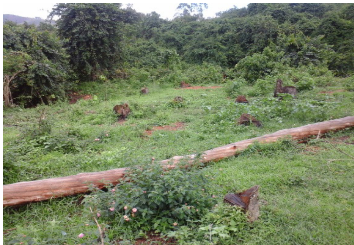
Figure-4: Tree cutting along river Rwizi.