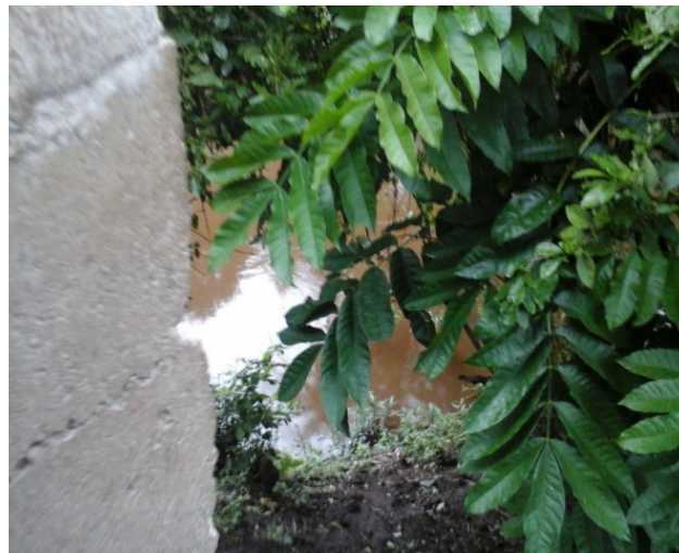
Figure-7: Wall of a building raised next to the river waters.