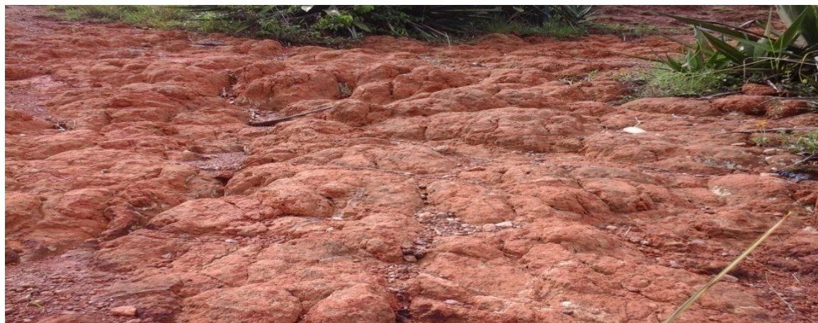
Figure-3: Degraded areas through cattle rearing along river Rwizi.