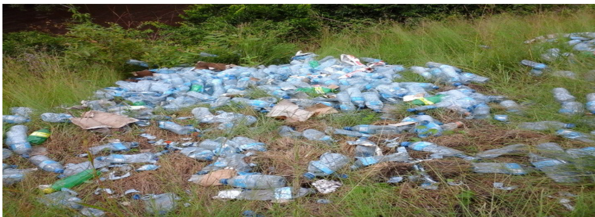
Figure-8: Water Bottles dumped beside the river after a function.