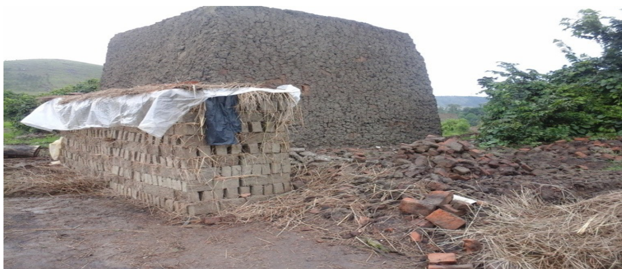
Figure-5: Brick lying at river Rwizi Bank leaves back unpleasant degraded lands.

Another human activity that affect river Rwizi is urbanisation and settlement where people have constructed along the river; to the extent of some buildings being raised at the river channel. Participants answered that urbanisation is among the main human activities that has degraded the river. This shows that R.Rwizi is degraded by urbanisation in the area since the majority of the participants agreed that there is urbanisation along R.Rwizi in the area. Since construction is associated with settlements this means man will impact much on the river by doing all his activities along the stream. As well people construct toilets next to the river bank; when they get full they direct the pipes removing materials toilets and latrine human waste to the stream; using the river as a dumping place. When people are dumping they don't care much that the water they destroy comes back to them for drinking. Also sewerage vehicles collect waste materials and dump into the stream in way of dodging dumping costs as the river is taken as free deposit area. Industrialisation has led to pollution of stream through dumping industrial and domestic waste into the stream. There is need for conservation of the river in order to save