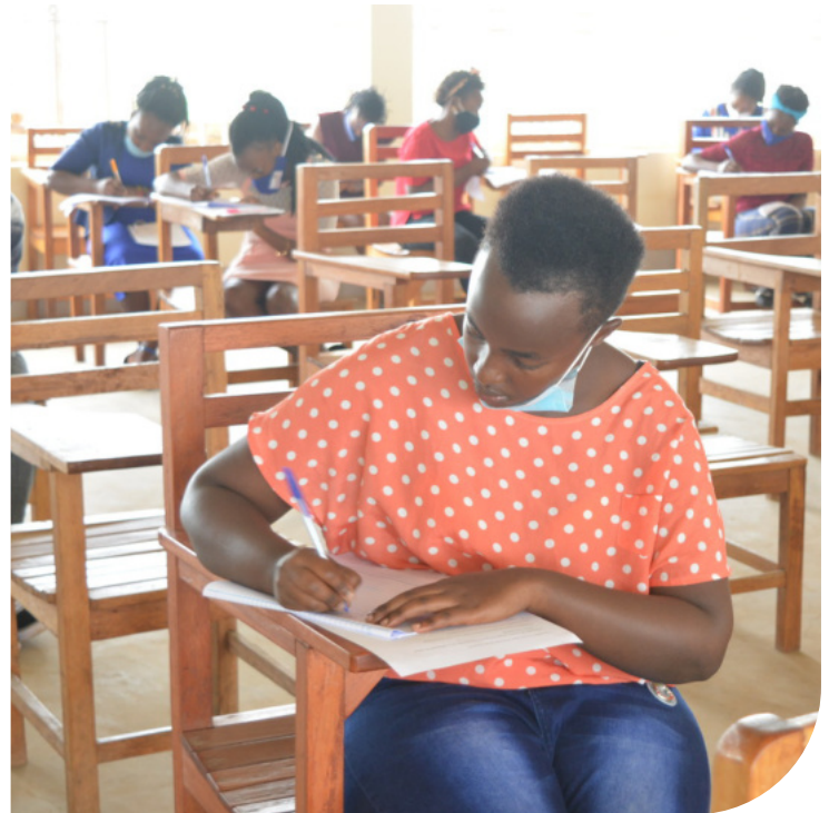
A student doing her end of semester examinations 2020

BSU successfully managed to teach online and held online-take home examinations for all years for the end of Semester Two, Academic Year 2020/2021. This was after the approval and ODeL reaccreditation by NCHE.