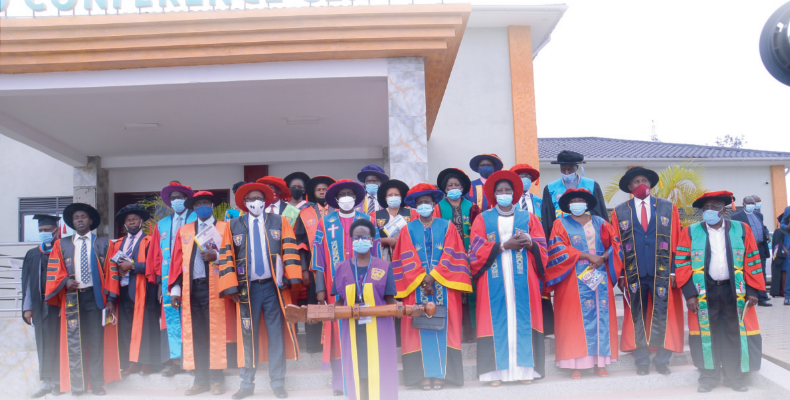
Chancellor's procession at the 16th Graduation Ceremony (Virtual) held at Igongo Cultural Center, Mbarara on 26th March 2021